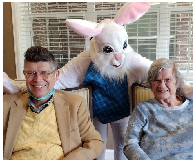
We had such a nice Easter Brunch with a surprise visit from the famous Bunny himself!!