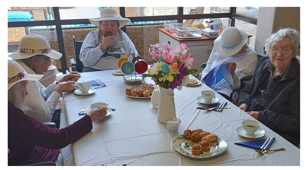
The ladies love their tea!