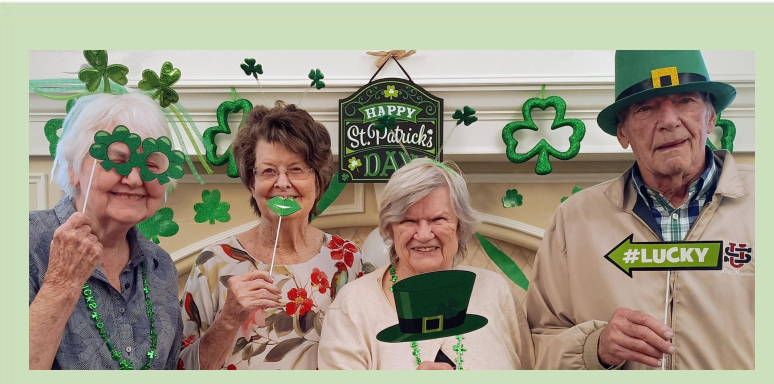
St. Patrick's Day was so much fun!